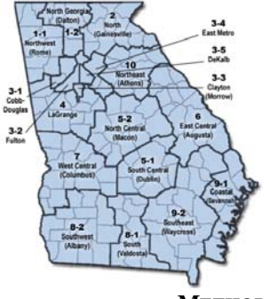
Figure 1. Georgia Public Health Districts

In GA, the PHD has the responsibility for monitoring SS data. Likewise, the PHD responds to alerts and initiates public health investigations and interventions; the state Division of Public Health (DPH) assists, if requested. To address these responsibilities, the Coastal PHD informally developed their own response practices.