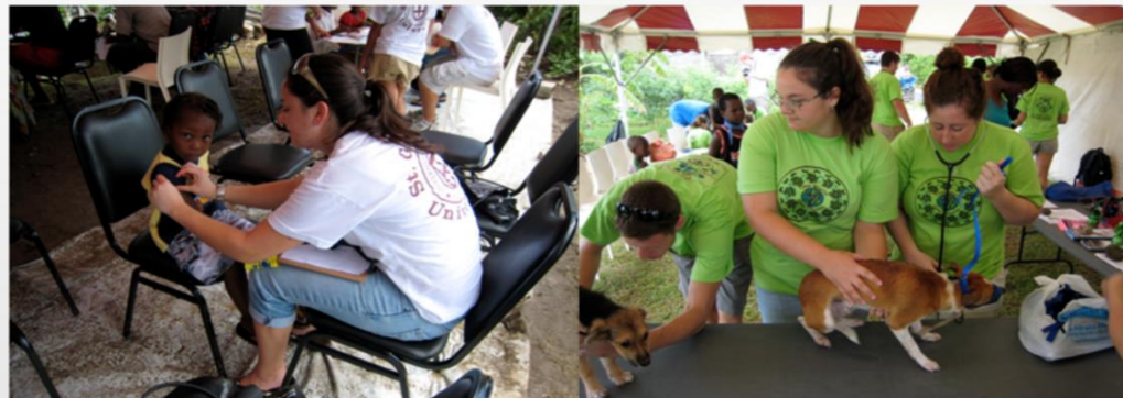
One World, One Health Event at St. George's University during 2007

For more information about One Health Day, please Contact Us